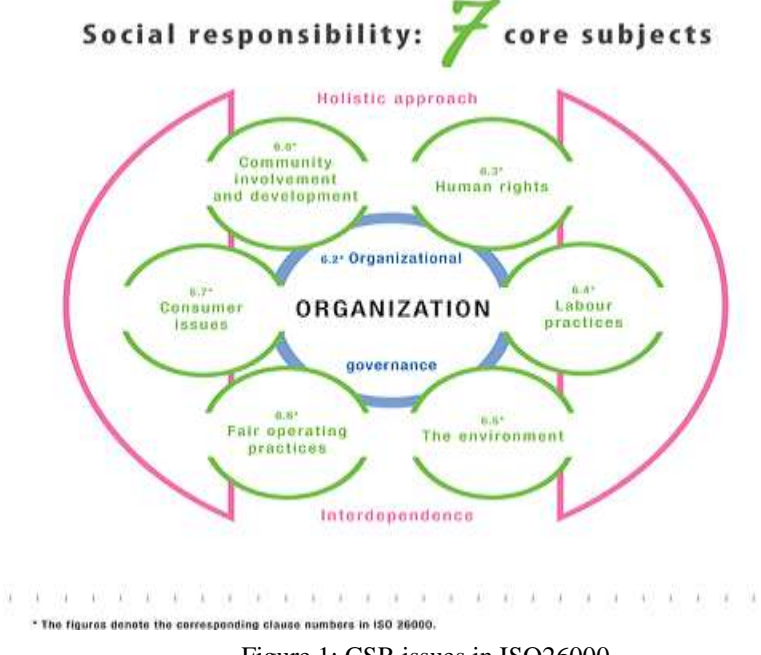
Figure 1: CSR issues in ISO26000.

CSR is a complex and ambiguous concept with no single conceptualization. However, the main topics of CSR as defined in ISO26000 include the following.