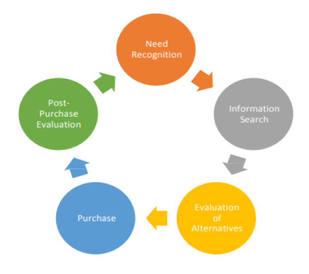
Figure 1. Five-stage decision-making progress. Source : Engel et al. (2006) [17].

The buying decision process is a decision-making process executed by customers corresponding to a potential market transaction, before, during and after the purchase of products and services [16]. In particular, this process is how buyers collect and assess information and then make a selection of products and services after comparing all alternatives. Engel et al. (2006) proposed a decision-making five-stage process that consumers go through in any purchases, encompassing need recognition and problem awareness, information search, alternatives evaluation, purchase decision and post-purchase behavior (Figure 1) [17].